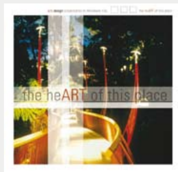
The heART of this place by Waitakere City Council

After 25 years of contemporary public art installations in Wellington the city now has a deserved reputation for its public art. This book is a collection of essays covering different aspects of the works, their histories and locations. It is well worth reading. Interestingly two of the authors and one of the sculptors have strong Gisborne connections. The library also holds a pocket guide to Wellington's sculptures.