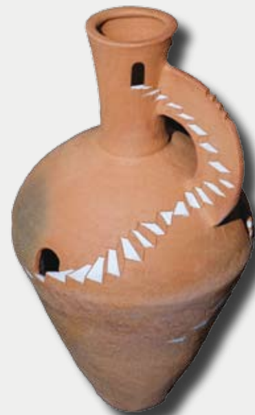
Stairs, Baye Riddell Tairāwhiti Museum Collection