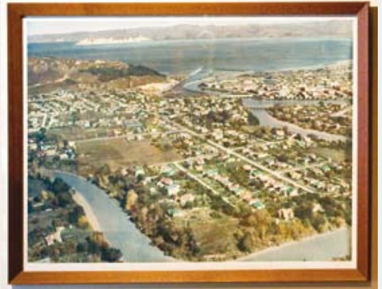
Gisborne 1947 -Not Just Black & White

Treaty 2 U: The history of the Treaty of Waitangi and the recognition and settlement of treaty grievances.