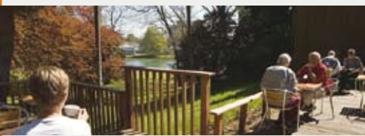
EXHIBIT C A F E