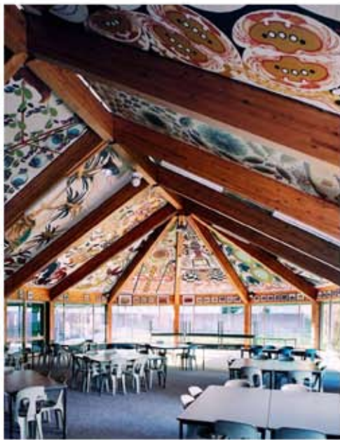
WAIKATO DINING HALL, TE AUPŪ COLLEGE, OAKHURST, 1984.