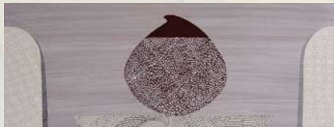
Featured in Kauwae 09