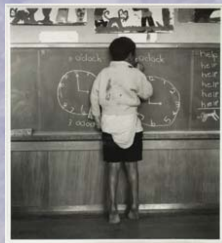
Parakino Pa