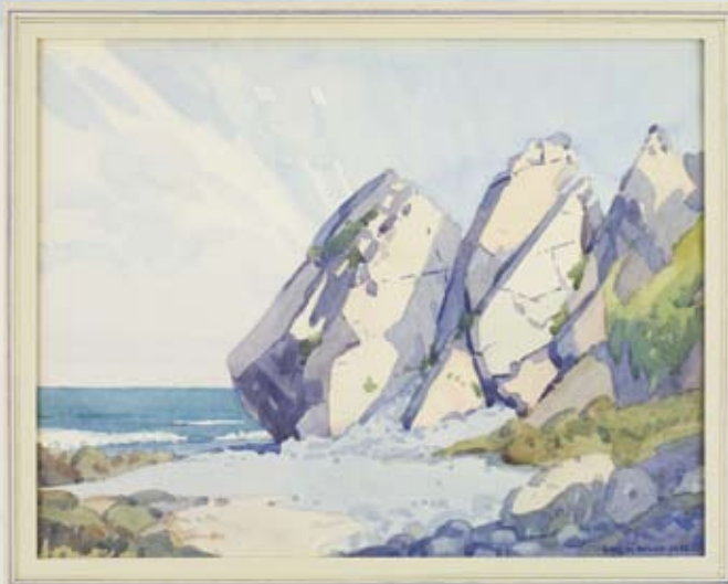
Featured in Toirau

Shibori is a Japanese term for several methods of dyeing cloth with a pattern, by binding, stitching, folding, twisting or compressing. This is similar to the tie-dye method.