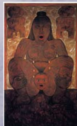
Paepae Threshold 1 - Robyn Kahukiwa