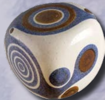
Dice - Anneke Borren